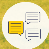
Communication with Schools