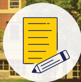
Standardized Test Preparation