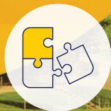
Extracurricular Activities Guidance