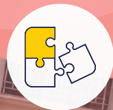
Extracurricular Activities Guidance